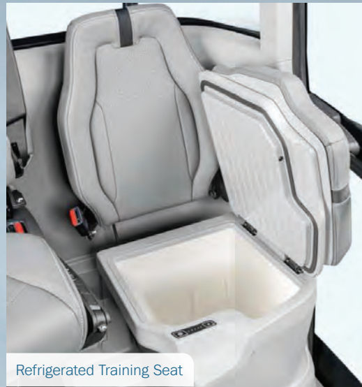
Refrigerated Training Seat