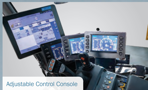
Adjustable Control Console