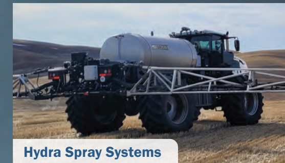
Hydra Spray Systems