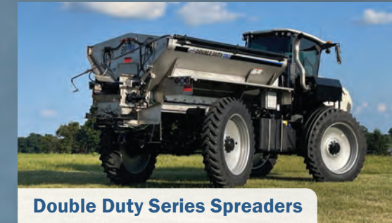
Double Duty Series Spreaders